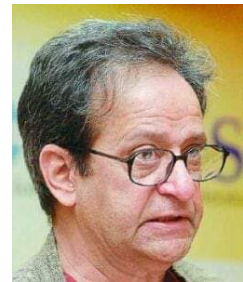
Aijaz Ahmad (1941–2022)